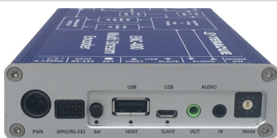
ENC-400 rear view