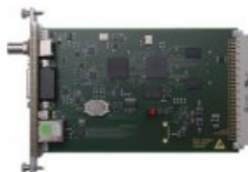
ENC/DEC-300 Series Cards